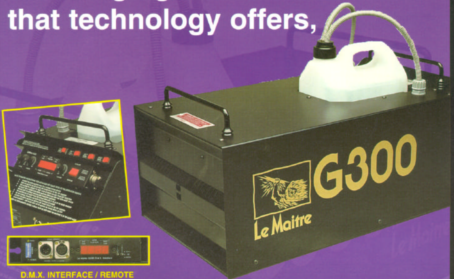
D.M.X. INTERFACE / REMOTE

Challenging all the limitations that technology offers,